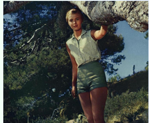
Jean Seberg in the adaptation of the novel by Otto Preminger

This course will rely on the participants' reading and speaking skills and will also offer additional opportunities for listening and writing in French .